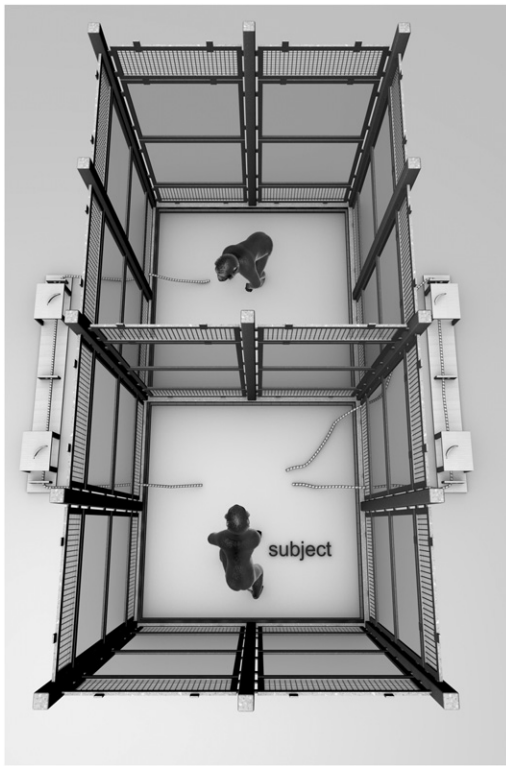
Figure 1. Experimental setup for chimpanzees in study 1

chimpanzees were wild-born, unrelated orphans. At the time of testing, all chimpanzees lived in social groups and had food and water freely available at all times throughout the tests. Subjects had participated previously in studies investigating their social cognitive abilities but were naive to the kind of apparatus and setup used in this study. All subjects could choose to stop participating at any time. In addition, 24 3-year-old children participated (12 males and 12 females aged 2 years and 10 months to 3 years and 4 months). They were tested at kindergartens in Leipzig, Germany. All were native German speakers and came from heterogeneous socio-economic backgrounds.