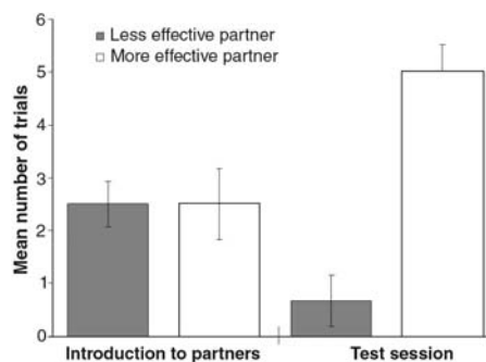
Fig. 2. The mean number of times ( \pm SEM) that the subjects chose the less or more effective partner in the introductory and test sessions of experiment 2.

Given the finding that chimpanzees recruit a collaborator only when needed, a second experiment was designed to test whether they can also learn to recruit the more effective of two partners on the basis of a limited number of interactions with each of them. Six chimpanzees, who had previously participated in experiment 1, were first reintroduced to the key mechanism and shown that now both sliding doors connecting to two rooms adjacent to the testing room could be opened by use of the key in each door (Fig. 1) (27). Then subjects were all introduced and tested with the same two potential collaborators. These two potential collaborators had previously demonstrated very different levels of success in pulling the food tray with others (27) and on this basis were designated as the more effective and the less effective partner. Subjects in experiment 2 had not previously collaborated with either of the two potential partners in this context [see (27)]. The testing procedure was identical to that in the collaborative condition from experiment 1, with the exception that in each trial, the more and less effective collabora-